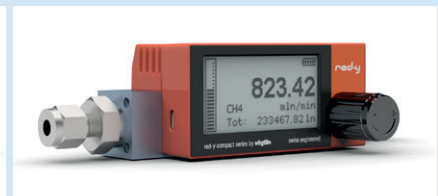
Various Inlet and Outlet Fittings