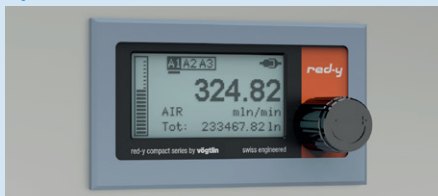
Panel Mounting Kit