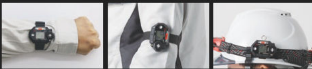
Attached to wrist (wristwatch type) *Attached to watch band