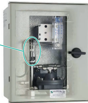
Remote sensor assembly (IP66/NEMA 4X)