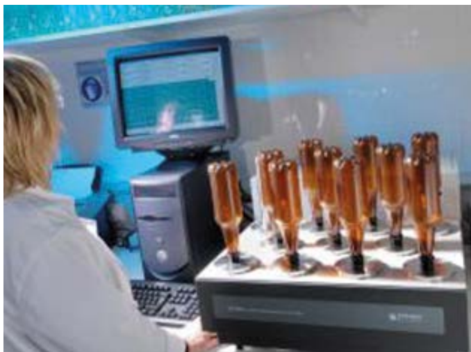
Test 11 chambers at once

One analyzer has the ability to evaluate a wide range of barrier alternatives and their corresponding performance.