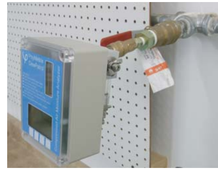
Mounted directly on quick connect outlet