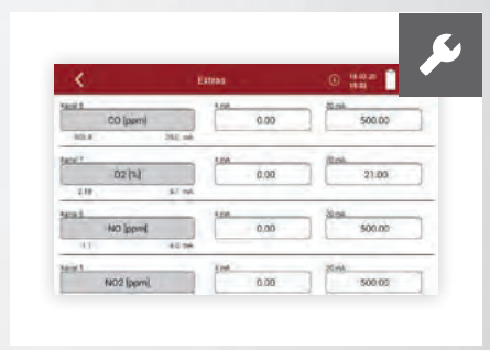
Set analog outputs