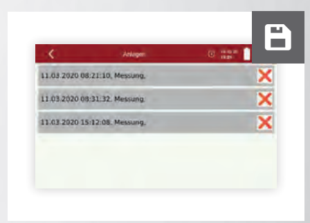
Save measurements by facility