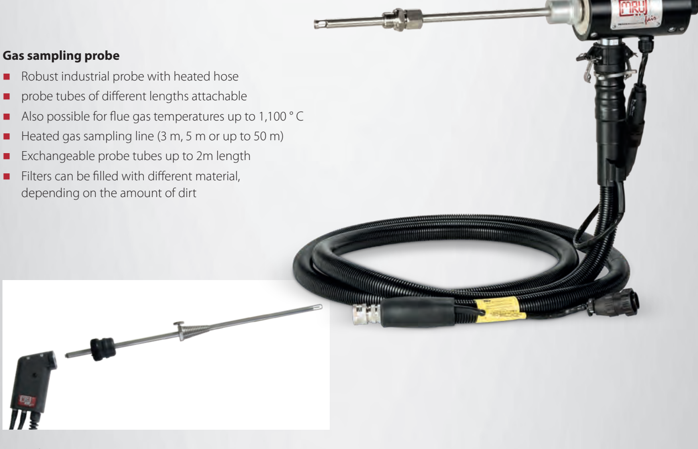
Probe for low dirt applications