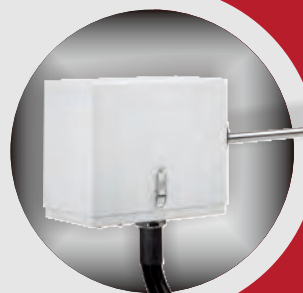
Gas sampling probe HD heated, with ceramic filter and back-purge