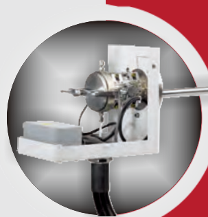
Gas sampling probe HD-GW heated, with borosilicate quartz filter element