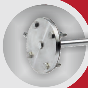
Gas sampling probe LD unheated, with in-situ sintered metal filter