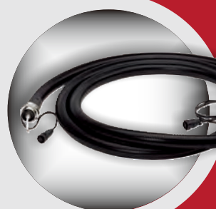
Gas sampling line Teflon, heated with temperature regulation