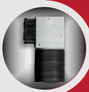
Thermoelectric gas cooler Peltier type with condensate monitoring and alarm